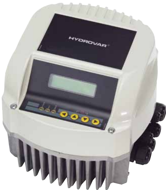
Pump Mounted Variable Speed Controller

The HYDROVAR Pump controller is a combination of a variable frequency drive (VFD) and a PLC for pump mounted applications. Controllers are specifically designed to work with all configurations of centrifugal pumps, matching pump output to varying system conditions while protecting the pump, the motor and the pumping system.